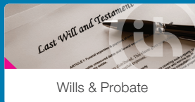
Wills & Probate